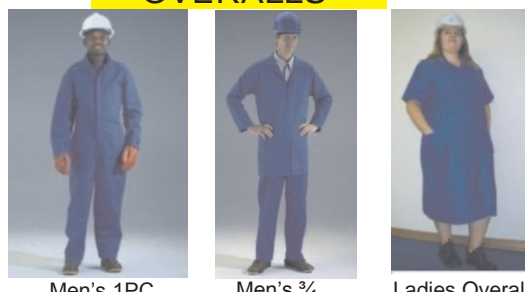
Men's 1PC Boiler Suit